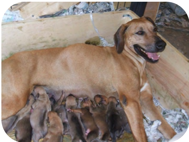
Caring for puppies