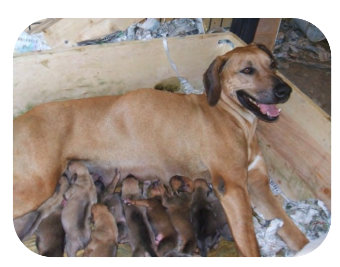
Caring for puppies