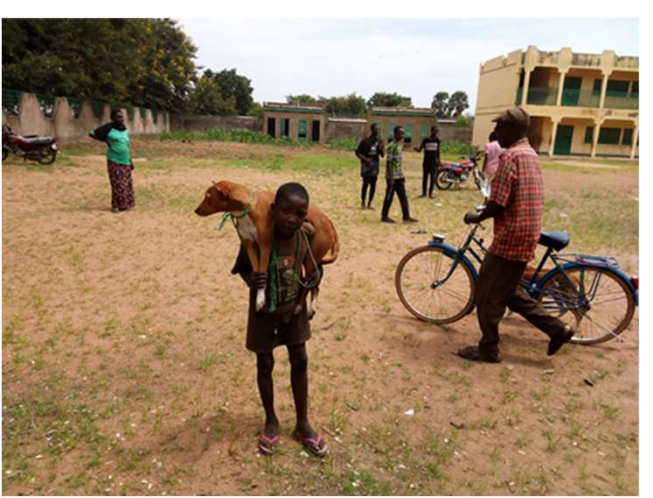
Afrique One ASPIRE