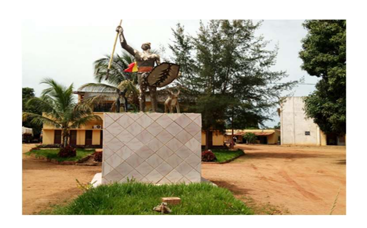
Major of Moundou town in Chad