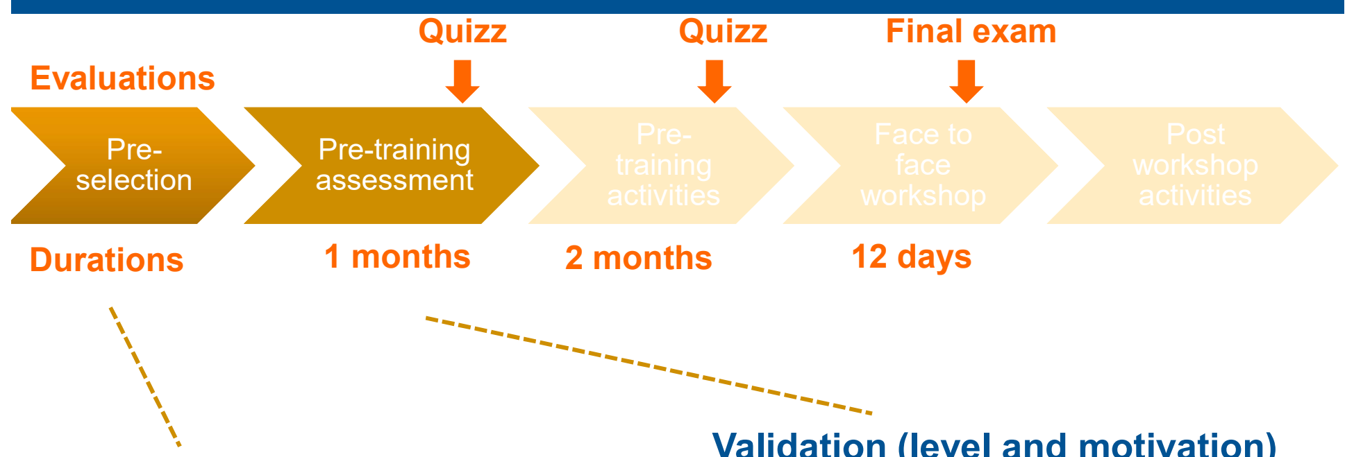
Pre-registration (on line)