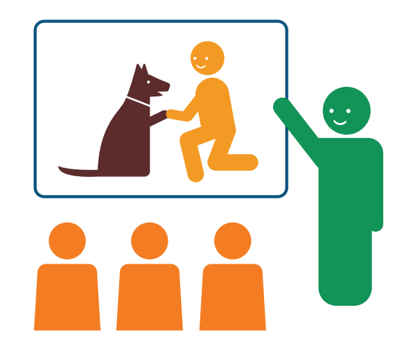
Learn how to behave around dogs to avoid dog bites