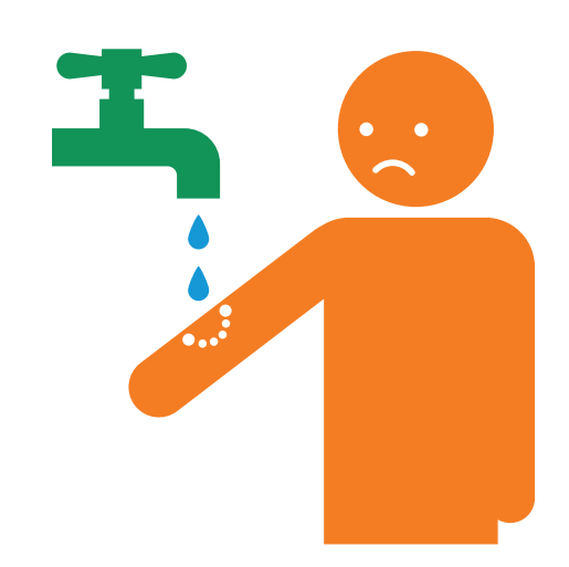
If you are bitten, wash the wound with soap and running water, and seek medical help immediately